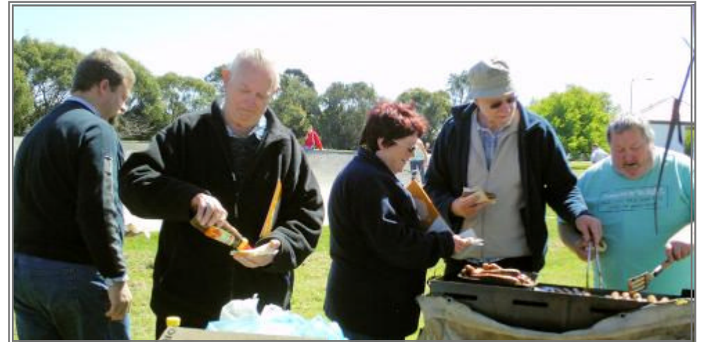
The Mission team from Melbourne School of Theology getting involved around George Town