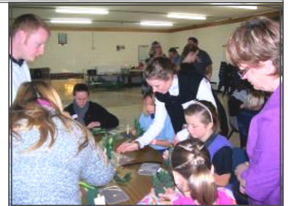
Right: SUPA Club

Our vision: "Growing a community of faith committed to Christ and making him known"